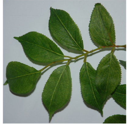
Mountain Ash Foliage