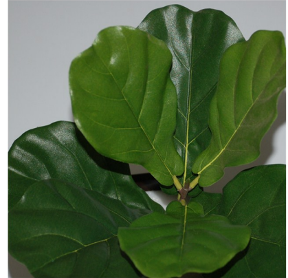
Fiddle Leaf Foliage