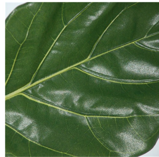
Oversized Contemporary Fiddle Leaf Foliage - Detail