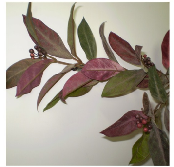
Burgundy Laurel w/ Berries