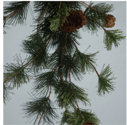
Japanese Pine Foliage