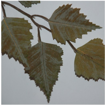
Birch - Green Silver