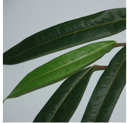
Weeping Ficus Foliage