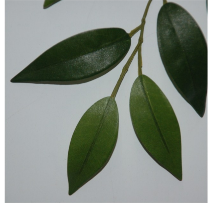
Light Green Smilax Foliage