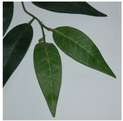
Solid Green Smilax Foliage