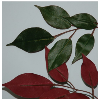
Deluxe Mini Burgundy Ficus