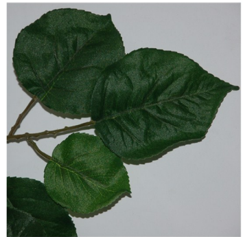
Dark Green Foliage