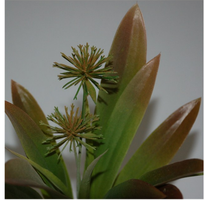
Flowering Dracaena Foliage