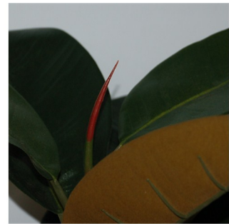
Rubber Plant Foliage - Back