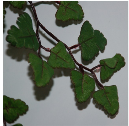
Black Olive Foliage - Dark Green