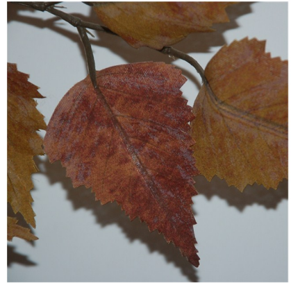
Autumn Rust Foliage