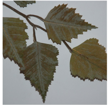
Green Silver Foliage