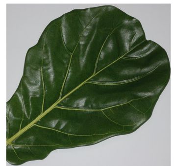
Oversized Contemporary Fiddle Leaf