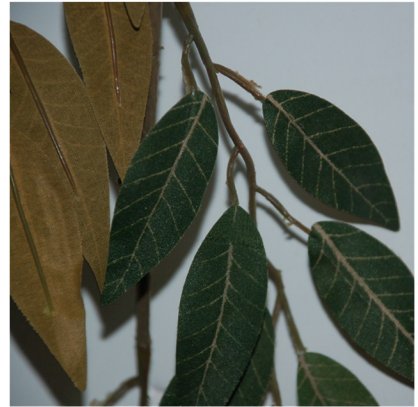
Blue-Green Smilax Foliage