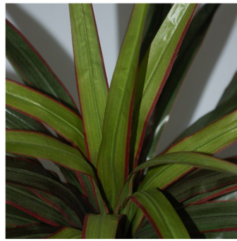
Dracaena - Fabric