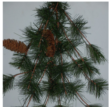
Mountain Pine Foliage