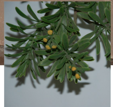
Tea Leaf Foliage