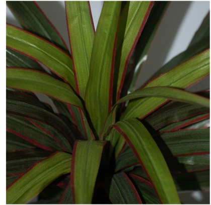
Fabric Head Foliage