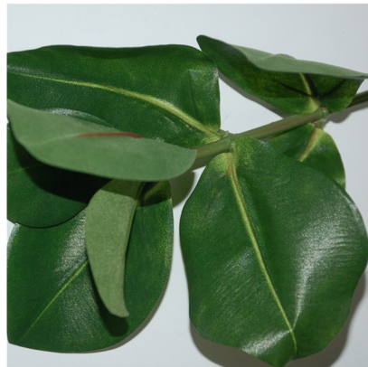
Golden Laurel Foliage