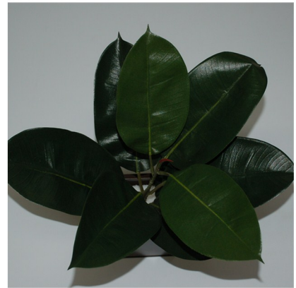
Rubber Plant Foliage