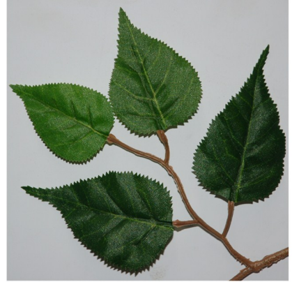
Silver Birch Foliage