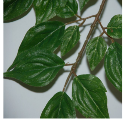
China Doll / Radermachea Foliage