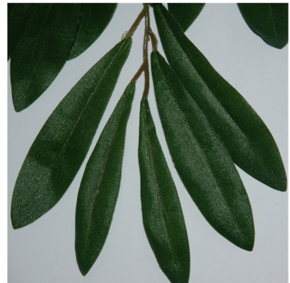
Green Olive Foliage - No Olives