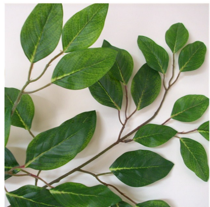
Bay Laurel Foliage