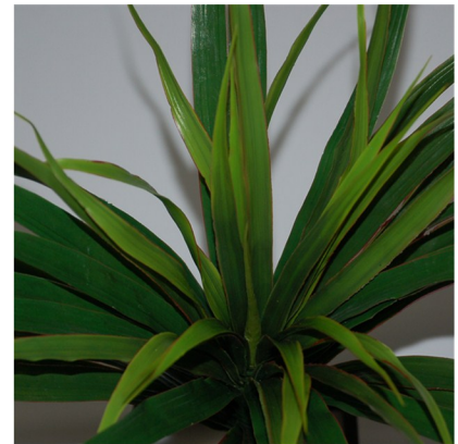
Plastic Head Foliage