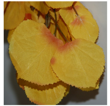
Gold Aspen - Win-Gold