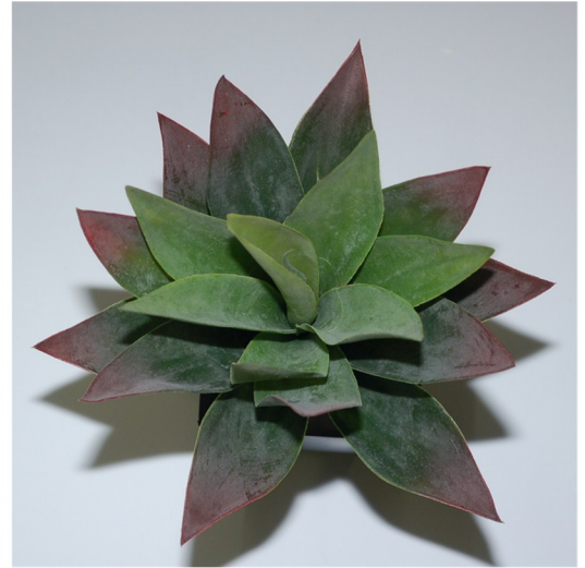
Agave Petite Foliage