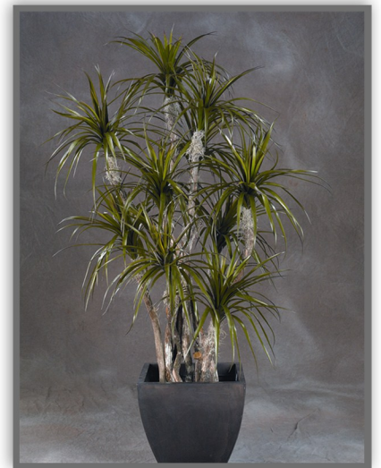
Character Tree Shape