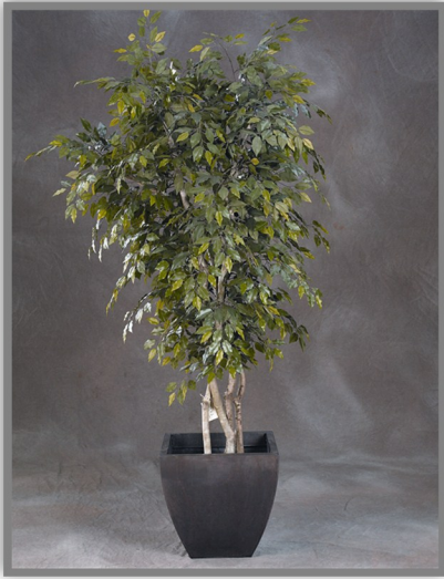
Traditional Tree Shape