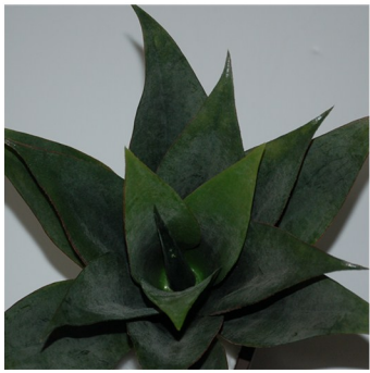
Agave - Mixed Heads