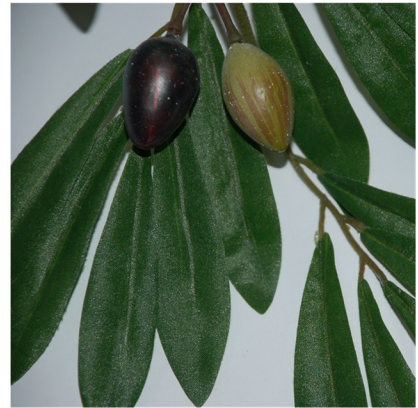
Green Olive Foliage