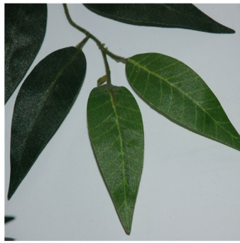
Solid Green Smilax