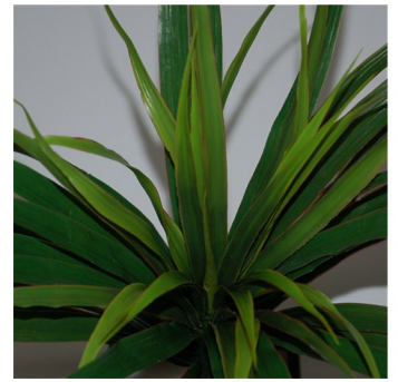
Dracaena - Plastic