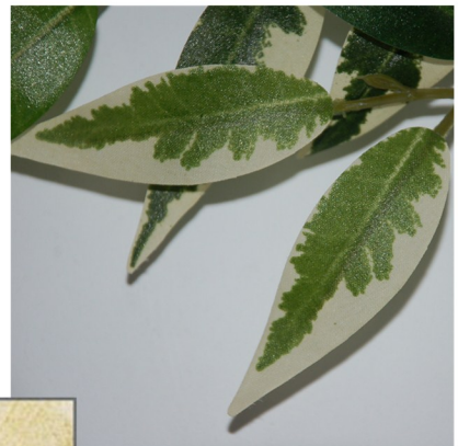
Variegated Smilax Foliage