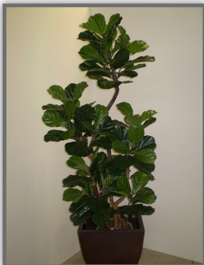
Abstract Tree Shape