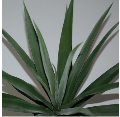
Stiff Yucca Foliage