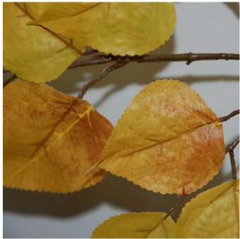
Gold Aspen - Cottonwood