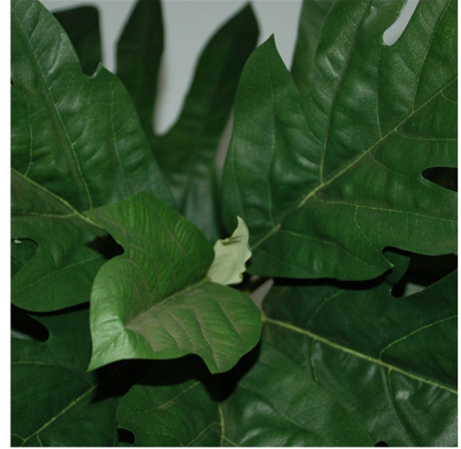
Euro Breadfruit Foliage