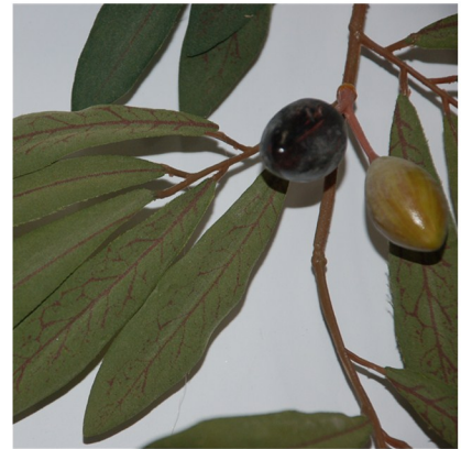
Frosted Olive with Olives