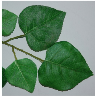
Green Aspen - Light Green