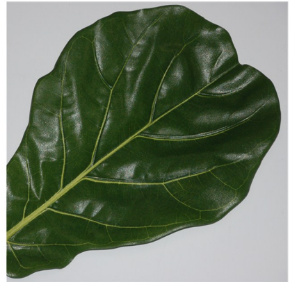
Oversized Contemporary Fiddle Leaf Foliage