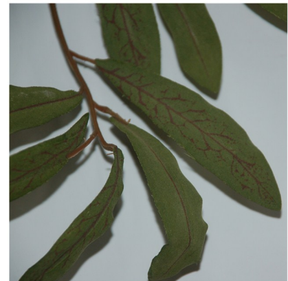
Frosted Olive without Olives