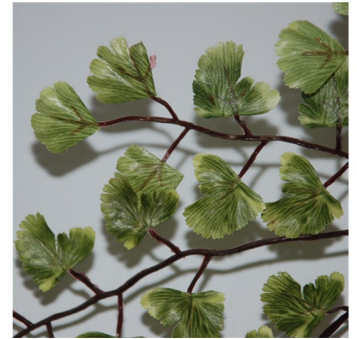
Black Olive - Light Green