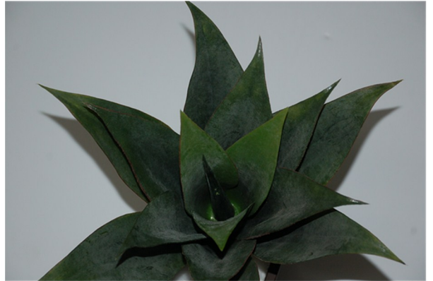
Agave - Mixed Head (Two Sizes) Foliage