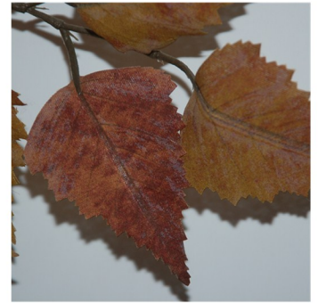
Birch - Autumn Rust