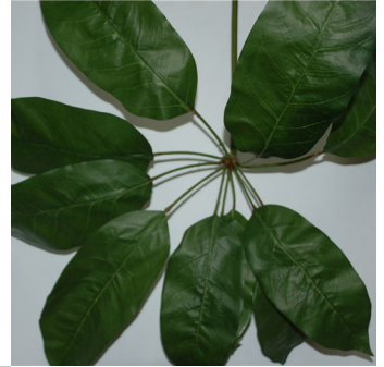
Deluxe Schefflera (two sizes)