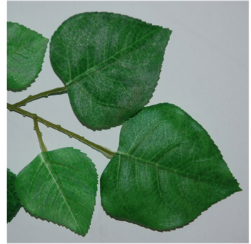
Light Green Foliage