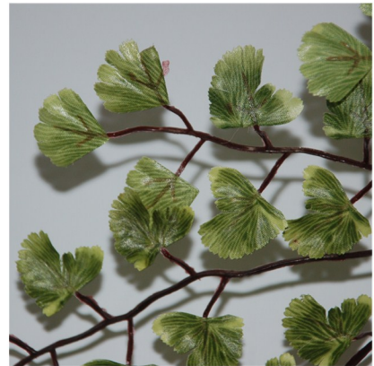
Black Olive Foliage - Light Green